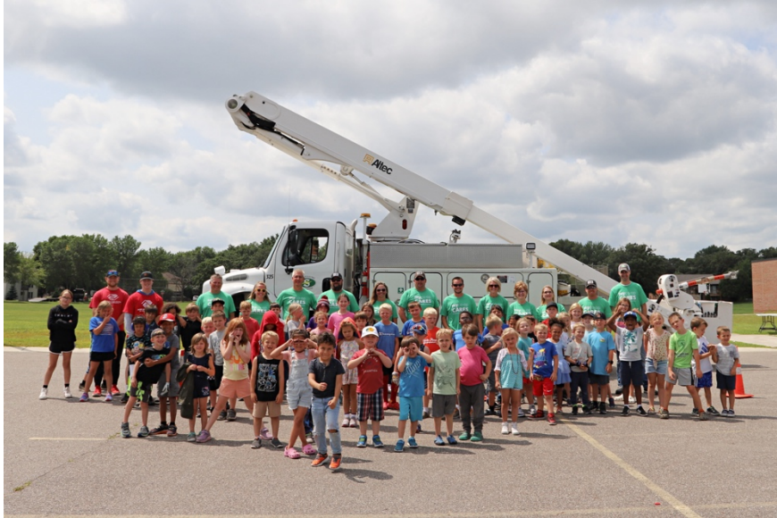
Stearns Electric employee volunteers with Westwood Boys & Girls Club of Central MN students and workers.