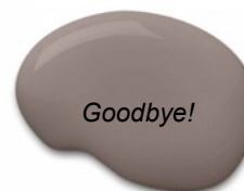
2017 Color of the Year: Sherwin Williams Poised Taupe SW 6039