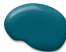
2018 Color of the Year: Sherwin Williams Oceanside SW 6496